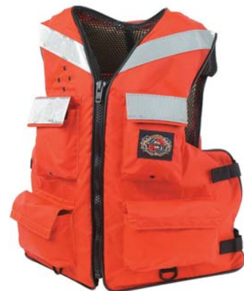
Work Life Jacket Stearns ILV-465 Designed for all-day comfort