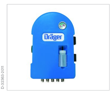
Dräger PAS® Filter - wall-mounted